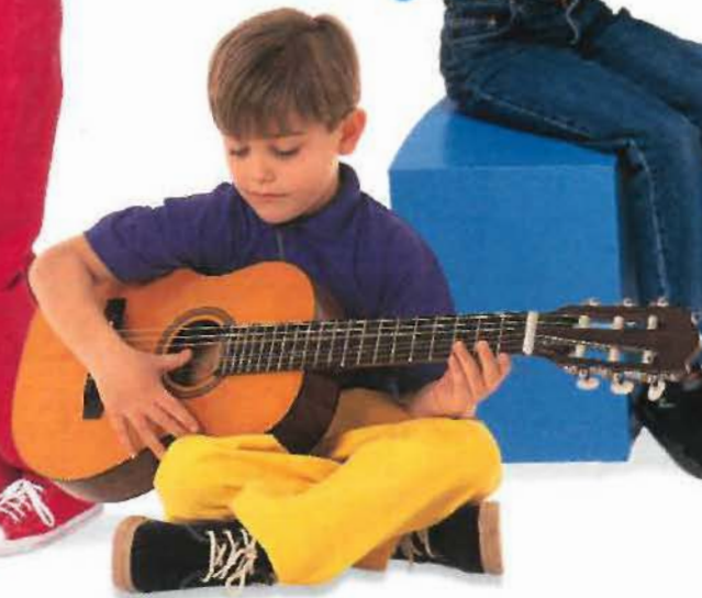
playing the guitar