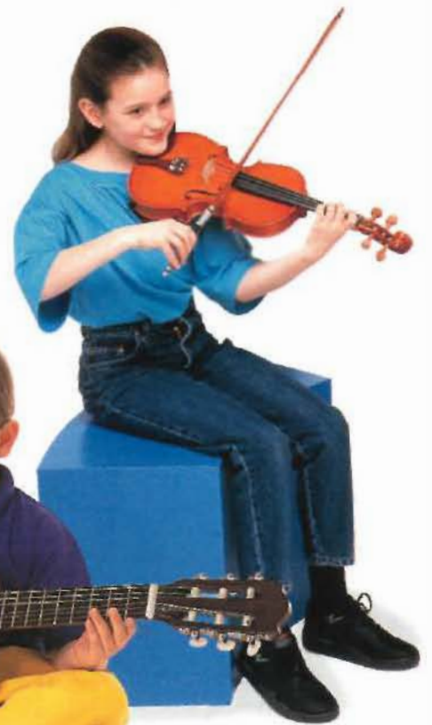
playing the violin