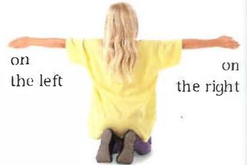
on the left