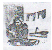
( wash )